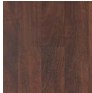
Brazilian Walnut (BW)